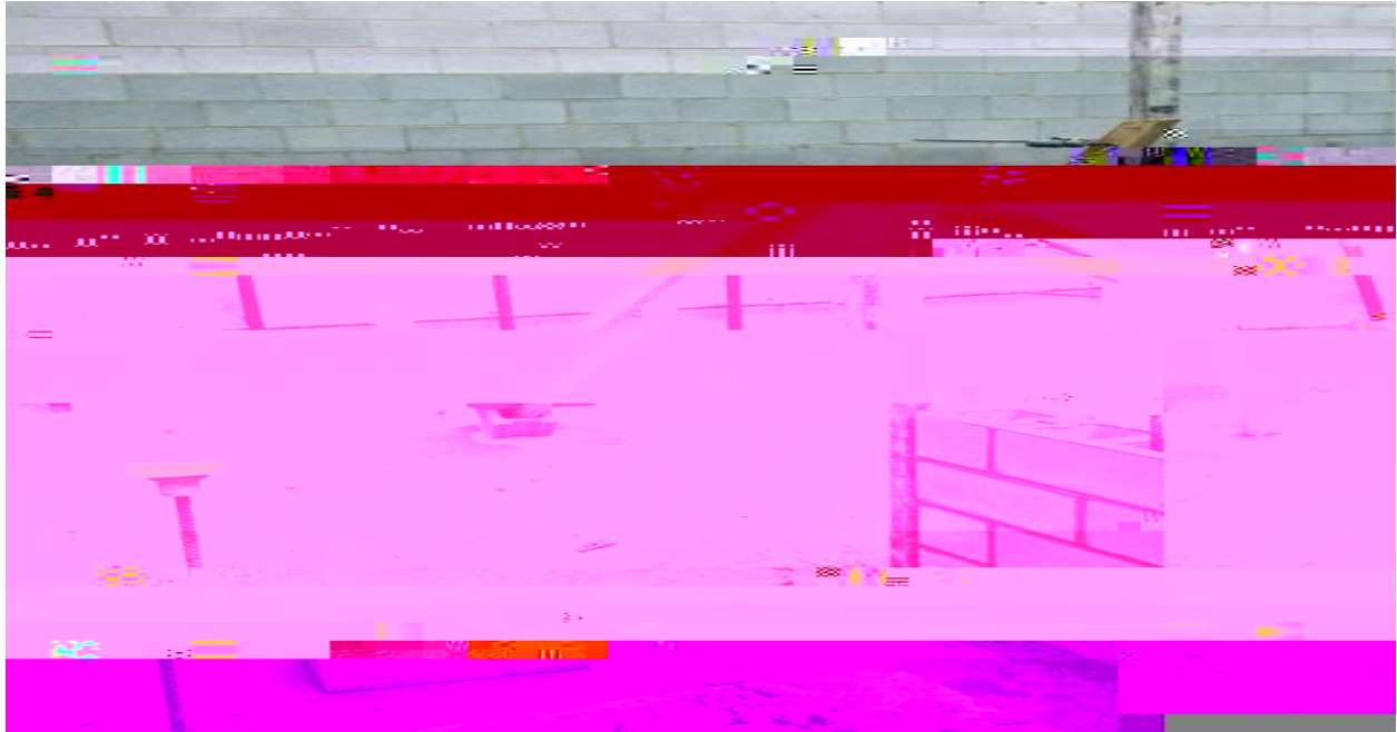
plumbing rough in D wing