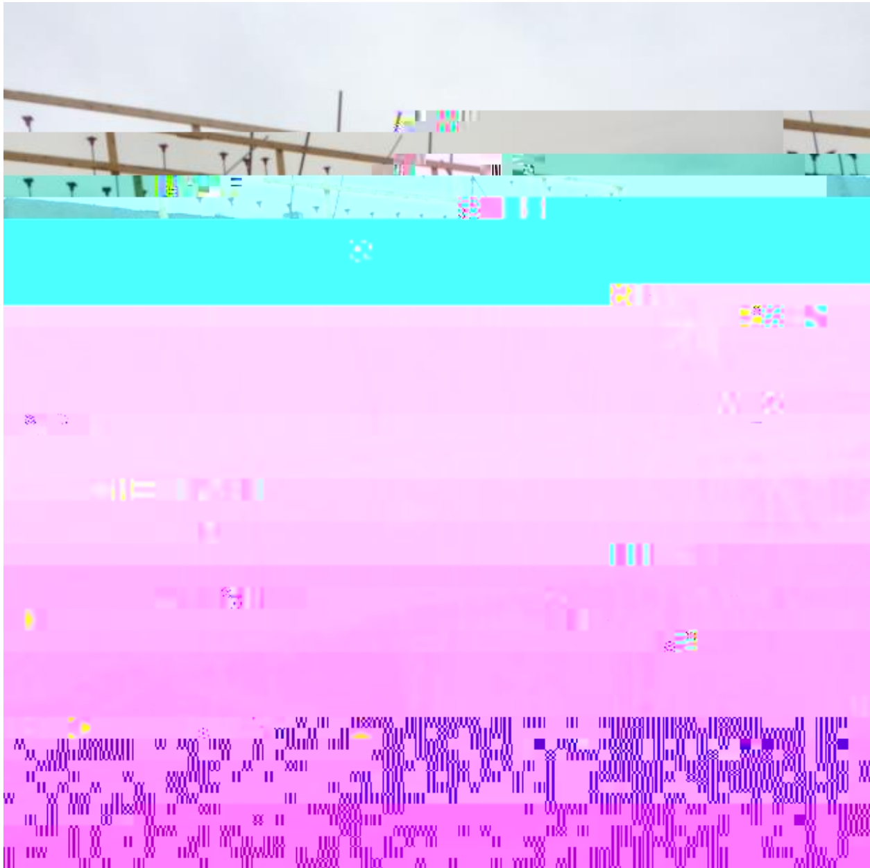
scaffold removal A wing & C wing

CONTRACT: Construction Management @ risk ARCHITECTS HG Reynolds PROJECT NO.: